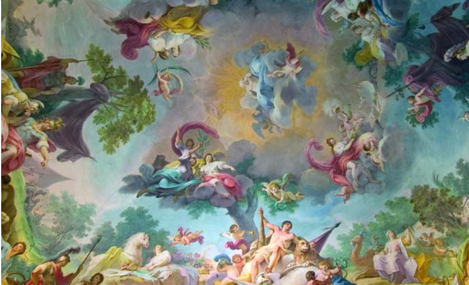
Frescoe in the Royal Palace of Caserta