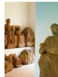
Basilica of Sant'Angelo in Formis, apse