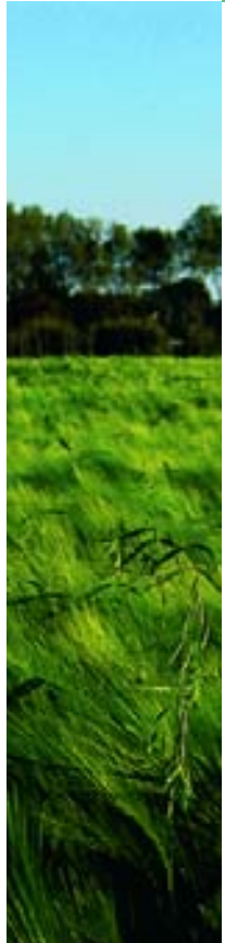
The Domitian Coast