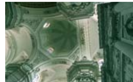
The Cathedral of San Paolo, Aversa