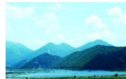
Regional Park of the Taburno