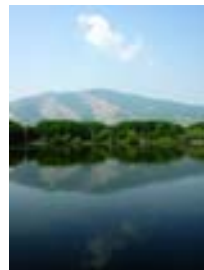
Falciano Lake Reserve