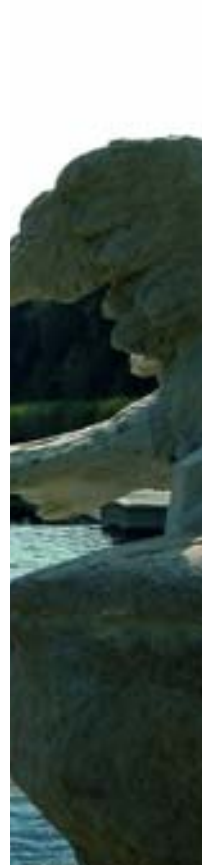
Royal Palace of Caserta

This is the area referred to as “ Campania Felix ” by ancient populations due to its privileged position and the fertility of its soil. Irrigated by the Volturno and favoured by a mild climate, the province extends from the sea to the Apennines, alternating between lush vegetation and places of great historic and cultural interest. The vast plains of the Caserta area open onto the sea and host one of the most famous and widely visited monuments of the Region: the Royal Palace (Reggia) of Caserta . Santa Maria Capua Vetere, Capua and Sessa Aurunca , are also of historic and archaeological interest, all concentrated in the area of Caserta known as Terra di Lavoro. The Domitian shore is the province's coastline, an area rich with pine stands, wide sandy beaches and famous bathing establishments.